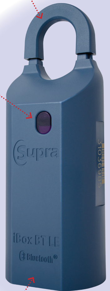
Large key container accommodates several keys and gate cards