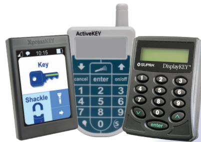
Works with any Supra key

Simple one-step shackle release for easy placement on properties